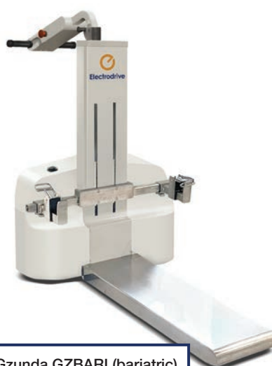
Gzunda GZBARI (bariatric)