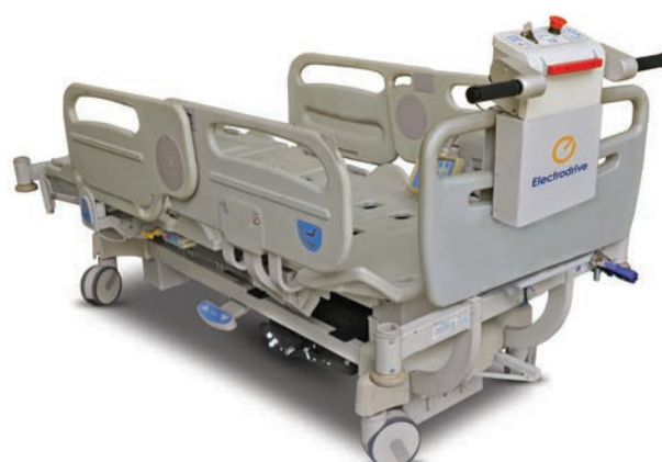
Powered Fifth Wheel (P5W)

If you can't find the product you are looking for, please contact our Healthcare manager on 03 9300 8500.