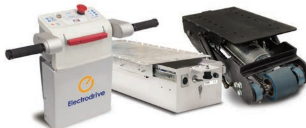
The P5W kit includes: Gzunda GZ10SL hand control unit, battery carriage (with 2x 33Ah MK-gel batteries), motorised retractable drive wheel and charger (7Ah).