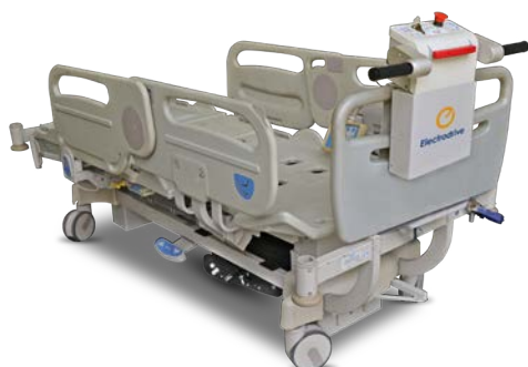
An example of the P5W kit fitted to a hospital bed.