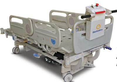
The P5W (hand control unit and drive wheel) fitted to a hospital bed.