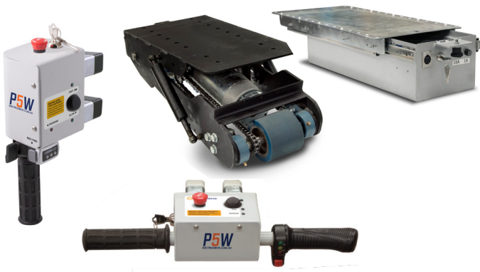
Pictured (from left to right): Hand controller (vertical); Hand controller (horizontal); Non-retractable fifth wheel (drive wheel); Slide-out battery carriage.

The Powered Fifth Wheel (P5W) is a retrofittable solution for converting your manually pushed trolleys into powered ones.