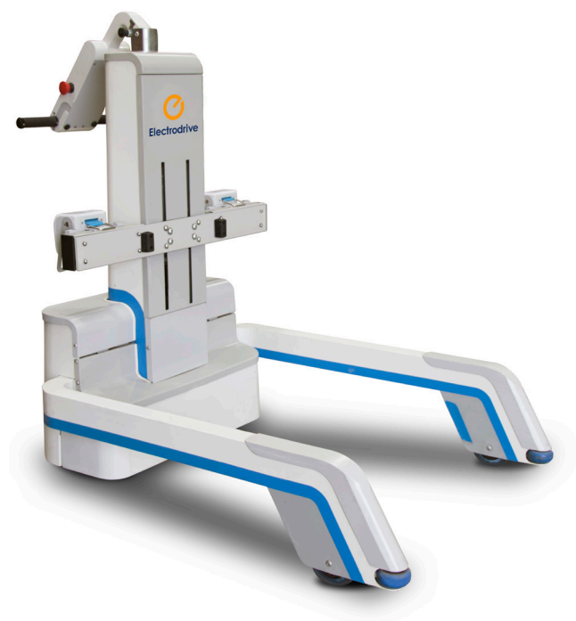
Gzunda GZS bed mover