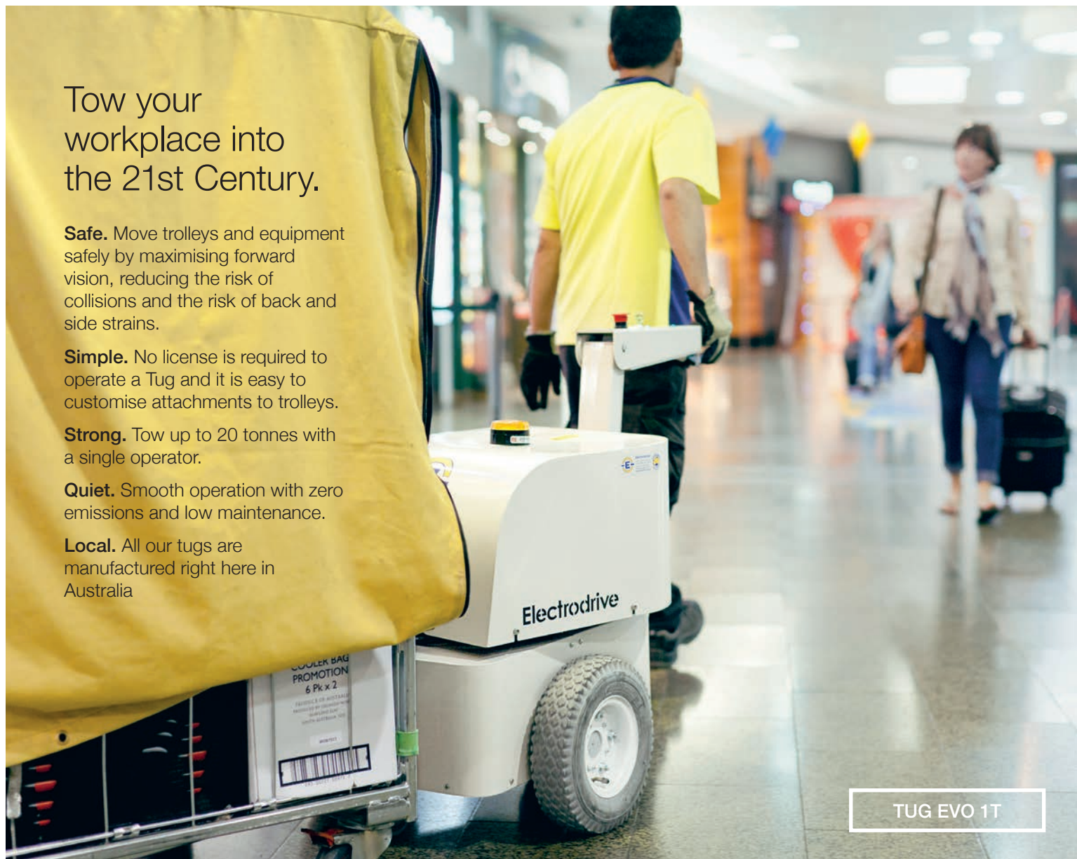
TUG EVO 1T

Local. All our tugs are manufactured right here in Australia